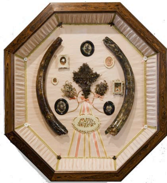
Dario Robleto, Some Longings Survive Death , 2008 Glacially released 50,000-year old woolly mammoth tusks, nineteenth-century braided hair flowers of various colors intertwined with glacially released woolly mammoth hair, carved ivory and bone, bocote, colored paper, silk, ribbon, typeset 57 x 8 x 53 inches

Dario Robleto: Some Longings Survive Death , on view at 3917 Main St (at the south end of Isabella Court buildings) will be open Saturdays from 11 am – 6 pm through the end of the year. Private tours are also available by appointment through Inman Gallery. Some Longings Survive Death is a unique exhibition which presents a major new body of work by Dario Robleto, the artist's most ambitious to date. The eight large-scale works on view were developed for two unique, site-inspired exhibitions: Human/Nature: Artists Respond to a Changing Planet (Museum of Contemporary Art, San Diego; and Berkeley Art Museum, Berkeley, CA) and Heaven is Being a Memory to Others (Frye Art Museum, Seattle, WA). Presented together for the first time, the sculptures trace the limits of mortality and extinction. Robleto proposes regenerative narratives, mixing natural history and tokens of desire into remedies for the inevitable losses of time.